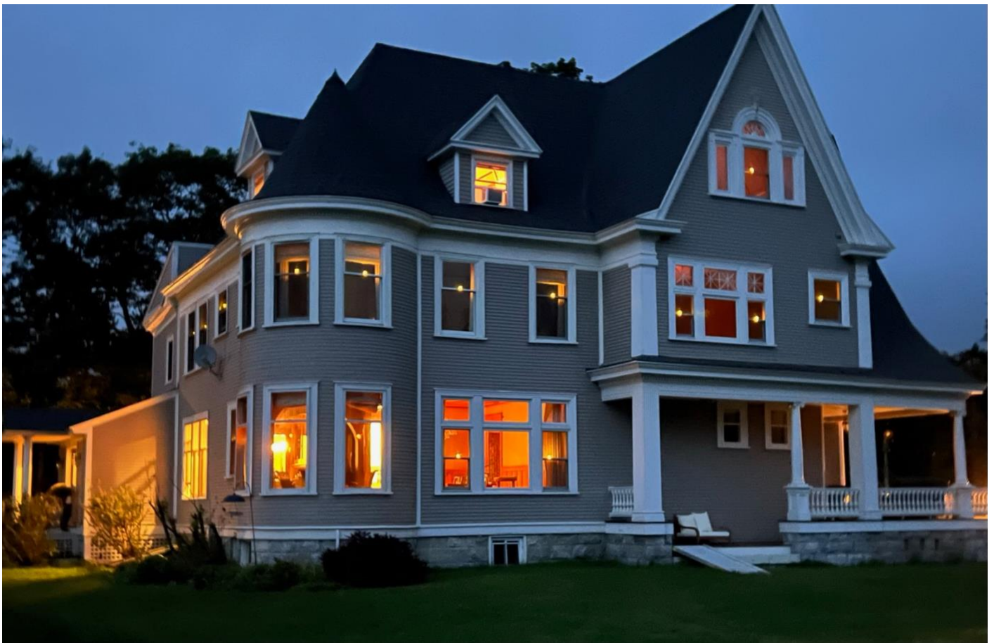
Stone Lions Farmhouse

If you have questions or concerns about your coursework, your instructor is here to help. For technical issues with Moodle, please reach out to Moodle Customer Service at Moodle or call (866) 361-8965. You can also check the course materials on Moodle to find your instructor's office hours. Don't hesitate to seek assistance—your instructor is committed to supporting and guiding you throughout your learning journey.