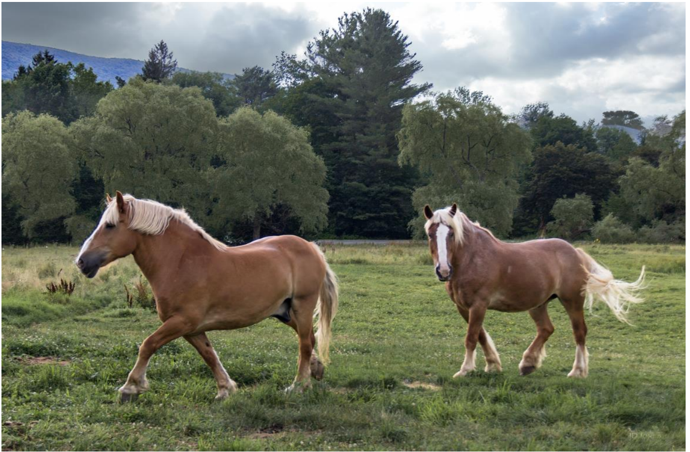
Clyde and Jack - Our Belgium Draft Horses