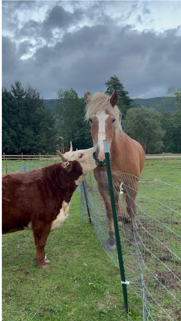
Mimi and Jack!

Violating this policy may result in severe disciplinary actions, including formal reprimands, confiscating prohibited items, or termination of affiliation with the School. NESBEM is committed to maintaining a safe and secure environment for all.