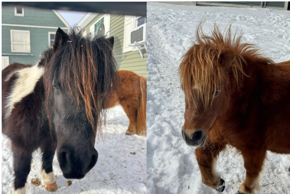
Our Shetland ponies, Mushu and Daisy!

We proudly offer specialized Ayurveda and Integrative Herbal Medicine programs tailored for those looking to merge ancient healing practices with modern wellness approaches. These programs thoroughly explore the connection between nature and health, equipping students with practical tools to incorporate time-tested techniques into today's healthcare landscape.